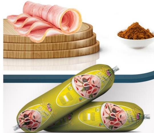
Ingredients | Halal frozen beef meat-Vegetarianimprovers-Soyprotein-Milkproducts-Table salt-Spices-Food gradephosphate-Monosodium glutamate-Vitamin (C) 500 ppm-Sodium nitrite100ppm.E.S.1114/2005