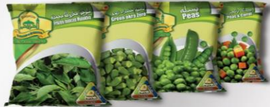
Ingredients | Frozen Vegetables . E.S. 1676/2005